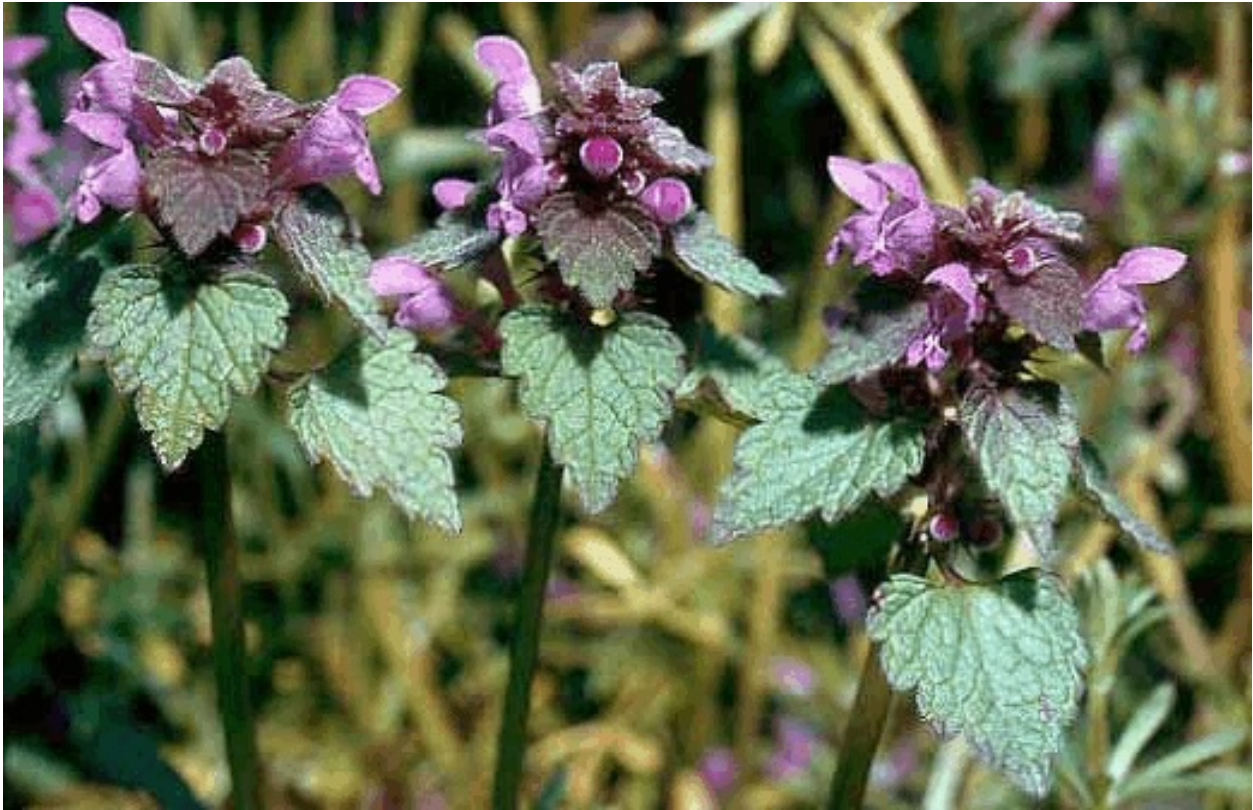
The "red dead nettle", "rubrum lamium" or "lamium purpureum".

that under our feet dead men's bones lay closely packed; the ridge could no longer contain a